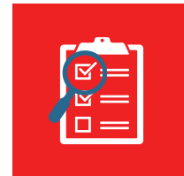
Drug Pricing/ Transparency

“ We get one vote in the election process which generally represents a person’s support for a representative who most aligns with their beliefs. I have joined TakPAC to support development, ingenuity, and progress in the pharmaceutical and bioscience industry. By supporting policy makers through the TakPAC that align with what I believe our industry has yet to do, I am extending my vote to lift up the needs of patients and secure my hopes for better health care options in my communities future and the future of my children. ”