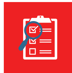
Drug Pricing/ Transparency